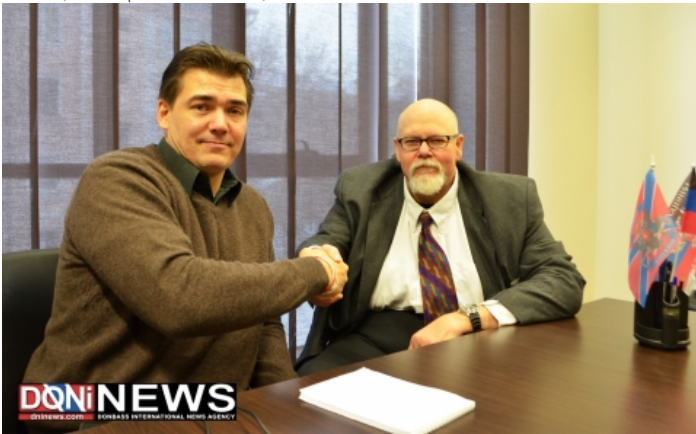
Ex-CIA official in Donetsk: 'US business is to export death and destruction here' - DONi Video (Part 1) Jan 23, 2016 | Donbass Life , Editorial