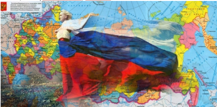
Why the West will never either defeat or forgive Russia Jan 22, 2016 | Editorial , Geopolitics