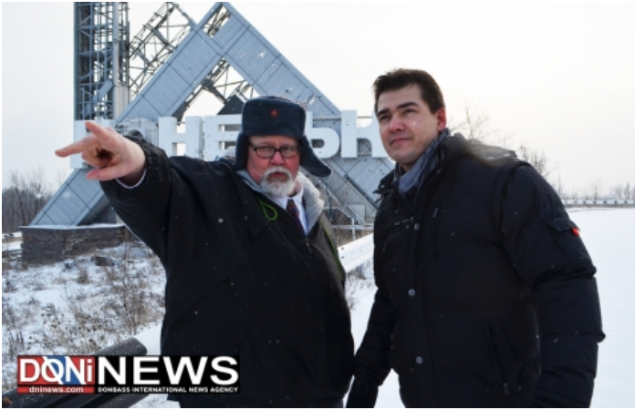
Ex-CIA official in Donetsk Airport: 'Destruction is like in major World War' - DONi Video (Part 2) Jan 23, 2016 | Donbass Life , Editorial