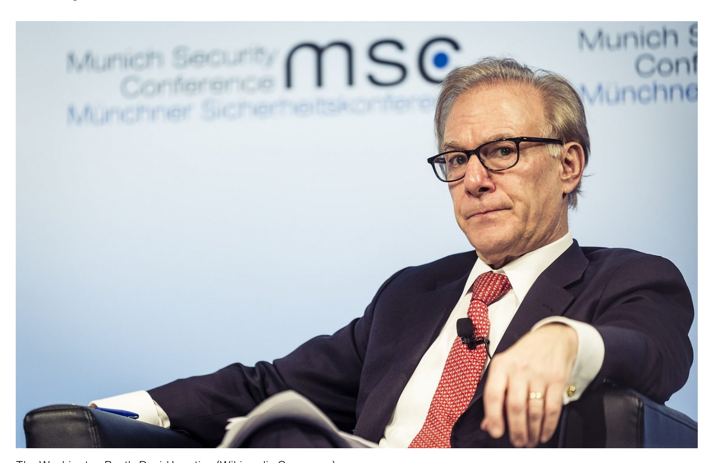
The Washington Post's David Ignatius

The intelligence community uses the media to manipulate the American people and pressure elected politicians.